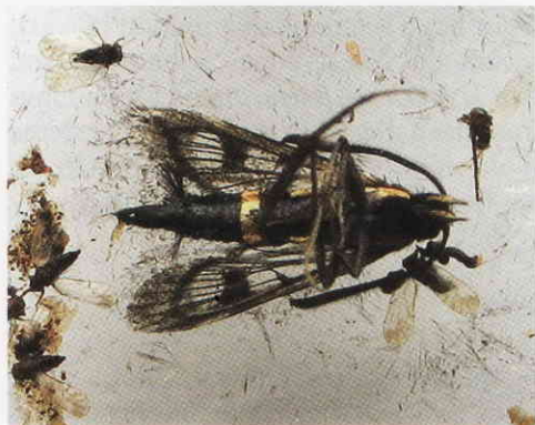
Fig. 2: Dead specimen of S. soffneri (ventral view) on bottom of the funnel trap VARs+, leg. Predovnik.