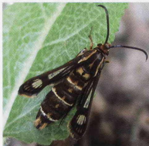
Fig. 4: Female of Ch. doleriformis colpiformis , e.l., ex. S. pratensis , leg. Predovnik.

of the known distribution of S. soffneri in Europe. This find strongly suggests the presence of other still undiscovered populations of this clearwing species in the mountains of northern Italy and perhaps also in the Balkan Peninsula.