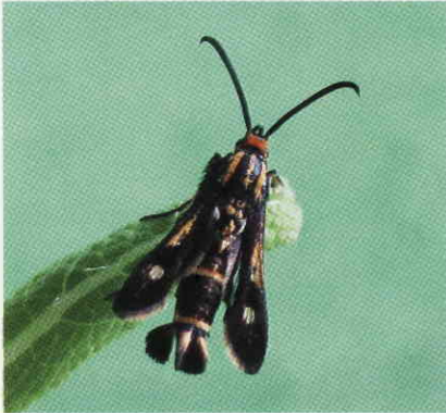
Fig. 6: Female of Ch. nigrifrons , e.l., ex. H. perforatum , leg. Predovnik.