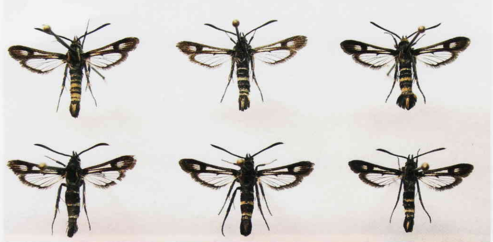
Fig. 7: Set of male specimens of B. himmighoffeni f. baumgartneri from the locality of Gažon, leg et coll. Predovnik.