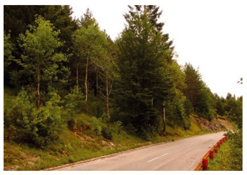
Figure 2. Typical habitat of the species in Gorski kotar

In Slovenia and Croatia the species occurs on warm (Figure 2) forest steppe slopes and plains, the edges of forests and in woodland clearings. The larvae feed