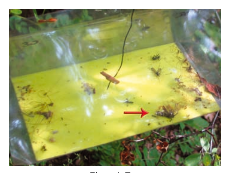
Figure 1. Trap

Pheromone lures for P. bohemica with the chemical composition E3Z13-18:Ac+E3Z13-18:OH (1:100) (Priesner et Špatenka, 1990) and pheromone lures intended for Parantherene tabaniformis (Rottemburg, 1775) with the chemical composition Z3Z13-18:OH+E3Z13-18:OH (37,5:1500) (Wageningen) were used in the course of the study. All the pheromones were made by PRI DLO, Wageningen, The Netherlands. Each pheromone was singly placed in a transparent plastic delta trap (RAG type, Wageningen), which had an exchangeable bottom coated with sticky material. (Figure 1) Traps were fixed on bushes or tree twigs at heights of 20 cm to 2 m above the ground. One or two traps were placed in each locality. The distance between the traps was at least 10-20 m. Captured specimens