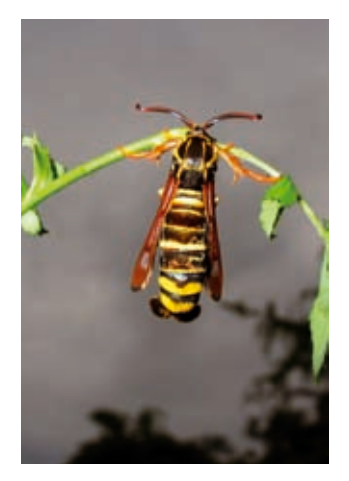
Figure 3. Pennisetia bohemica

over two years in the roots of rose species ( Rosa canina L., Rosa arvensis Huds., Rosa spp.) (Rosaceae), preferring roots just below or above ground, where it makes short tunnels and causes characteristic swellings. Pupation takes place in a gallery without formation of a cocoon. Collecting and rearing of caterpillars is described by Predovnik (2004). The adults swarm from the end of July until September, mainly in the middle of August (Špatenka et al., 1999; De Freina 1997). (Figure 3)